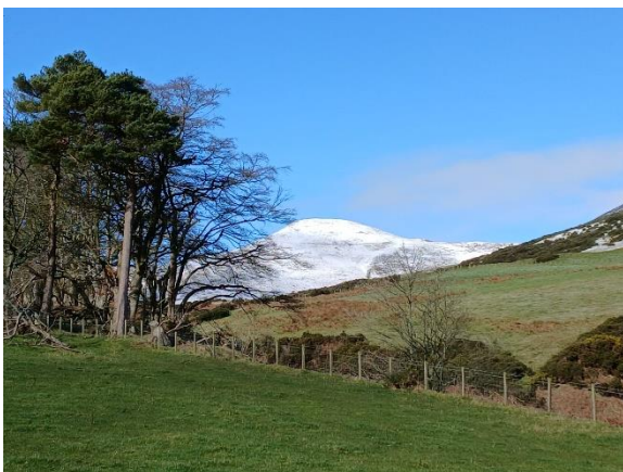
Scots pine, fields and snowy hills on my daily walk to work.

Being based at the Northern Research Station in Scotland has been an amazing experience: working at a site which is both rural, surrounded by forests, fields and the stunning Pentland Hills national park, as well as situated at the heart of a thriving biological research community, I've benefited from visits to the UK Centre for Ecology and Hydrology (a collaborator institution on the project), as well from scenic walks through the surrounding fields which are used for agricultural research and education by Edinburgh University and Scotland's Rural College.