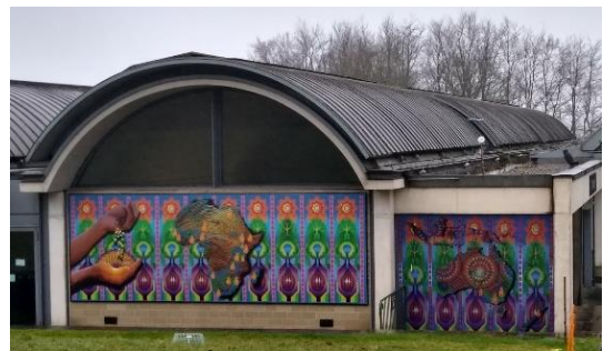
Top: Wakehurst gardens. Bottom: exterior of the Millenium Seed Bank

Working at Forest Research and contributing to research with real-world importance has been a very enjoyable experience which has reassured me that my career decisions to date have put me on the right path. I had previously wondered if my practical horticulture background would be a hindrance in moving towards a more scientific career; if anything, it's been the opposite, as my practical experience has been immeasurably useful in my current Forest Research position. I would encourage others with practical backgrounds working with trees or plants to consider getting involved with forest research or broader ecology and plant science as potential entry points to a scientific career, and I would likewise encourage those interested in biological sciences to consider how developing practical experience with plants could support their career and their research. Being able to integrate my practical and academic interests at Forest Research has made me excited about the prospect of pursuing further positions related to forestry, an area which I previously had little knowledge of. Ultimately, this internship has given me confidence in my ability to thrive in a professional research environment, as well as in my decision to pursue a career working on resilience in plant-soil systems.