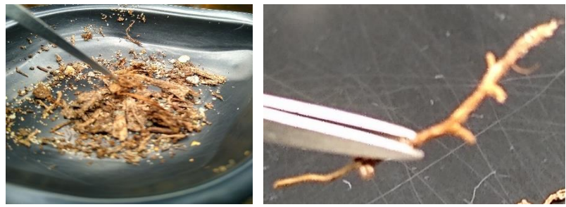
Extracting root fragments from soil samples with tweezers

Much of my time has been spent in the lab, where I picked through tiny soil samples under a microscope, extracting fragments of root which I then cleaned, weighed and scanned before using WinRHIZO root analysis software to estimate metrics like