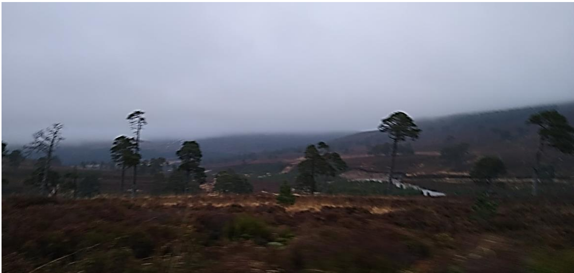
Remnant ancient Caledonian pinewoods at Mar Lodge Estate (above), and young Scots pine regenerating nearby thanks to conservation efforts (below)