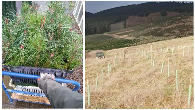
Left: moving potted Scots pine in preparation for field planting. Right: Planting birch and alder.

In addition to the technical data analysis that's made up the bulk of my internship, I've also had the chance to help with field trials, spending time in the greenhouse labelling and sorting trees as well as visiting field sites to plant trees and plan future trials. This included visits to a commercial Scots Pine forestry site at Tentsmuir in Fife and a visit to Mar Lodge Estate in the Scottish highlands. Seeing the estate's remnant ancient pinewoods as well as younger trees that have been beginning to regenerate thanks to conservation efforts was a beautiful and emotional experience which helped me to see the broader conservation importance of the project.