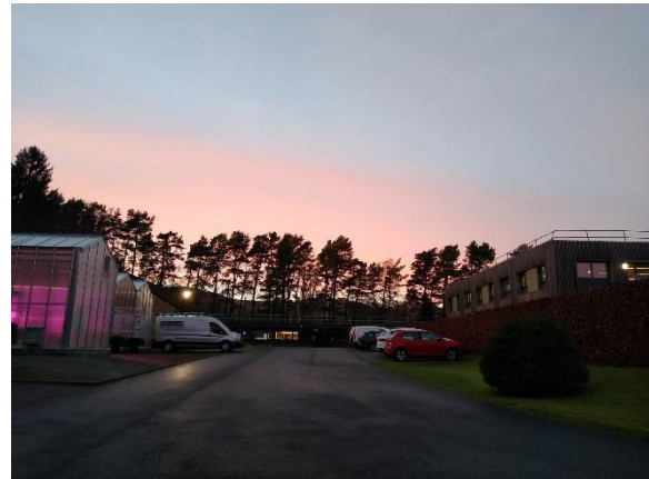
Sunset at the Northern Research Station, Roslin, Scotland, with Scots pines and the Pentland hills in the background

I'm writing this as I come to the end of my 4.5-month internship working on the Scots pine resilience project at Forest Research. This project explores the role of intraspecific (within-species) variation in resilience to environmental stress: experiments conducted so far involved growing trees from seed collected from wild populations across Scotland and other European countries, then exposing the seedlings to drought and flooding treatments in a greenhouse trial and assessing health outcomes across origin populations. My own research position examining the role of root systems in stress resilience has been a perfect way to build on my professional and educational background in horticulture, ecology and soil science, helping me to develop skills and experience that will be invaluable in my future career supporting resilience in plant/soil systems.